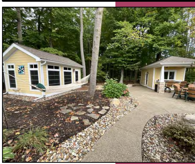
Offered by Southwest Michigan Resort Properties, LLC