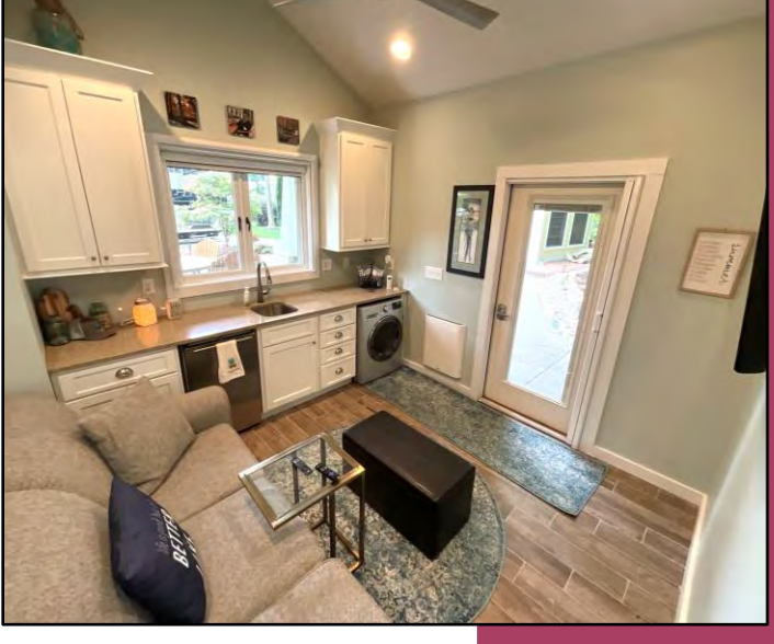
Offered by Southwest Michigan Resort Properties, LLC